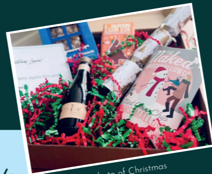
Customer photo of Christmas Fireside by Parry Creative