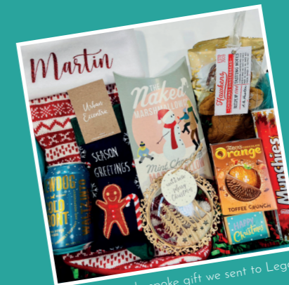
Example of a bespoke gift we sent to Lego

Whether you have a specific idea in mind or need help selecting the perfect items, we are here to assist you every step of the way. Gift something truly special, and let us craft a bespoke gift that perfectly matches your vision and exceeds your expectations.